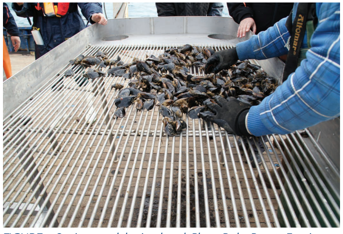
FIGURE 3. Sorting mussels by size aboard.

6-8 m. Storm conditions are mostly associated with currents and waves from the southwest and southeast. Waves from the southeast increase the influence of Mediterranean waters, which generally means an increase in salinity and seawater temperature. Upwelling events play also an important role on variation of environmental conditions on the Algarve coast and are responsible for the emergence of cold and productive waters that occur usually between April and October (Leitão et al. 2005).