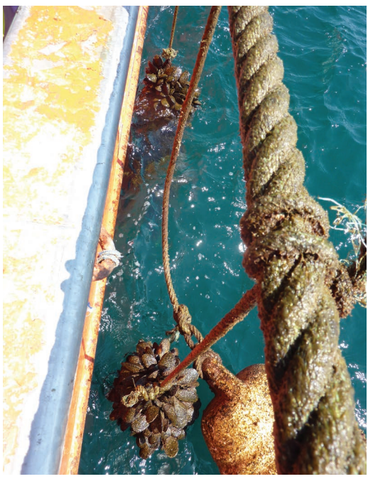
FIGURE 2. Mussel longline in the Aquaculture Pilot Production Area.

The Algarve's economy has always been closely linked to the sea and fishing has been an important activity since ancient times. Portugal has a long tradition of mollusk farming and freshwater and marine fish production.