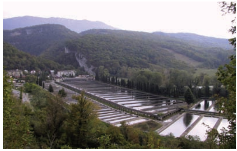
Pedigree trout-breeding farm in the Sochi region

together with variability and inheritance are the three factors determining the biological changes in the species and, also because of selection, the rate and success in new breed cultivation.