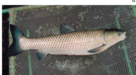
Ctenopharyngodon idella Rich