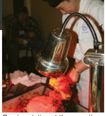
Carving station at the reception