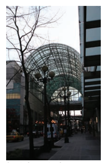
Seattle Convention Center

Whelan indicated that student he teaches have the opinion that farmed fish are inferior to their wild counterparts in terms of their healthfulness, including their levels of DHA. He showed data from studies that clearly demonstrated that, at least in the case of salmon and trout, higher levels of DHA can be obtained from cultured fish than those tak-