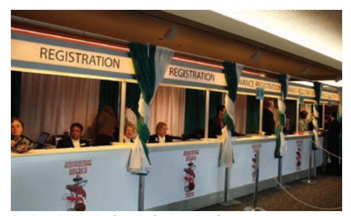
Registration at the Seattle Convention Center