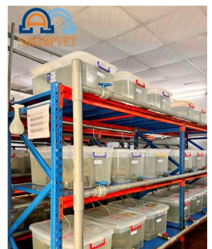
Figure 1. Shrimp from the study allocated in 90L tanks.