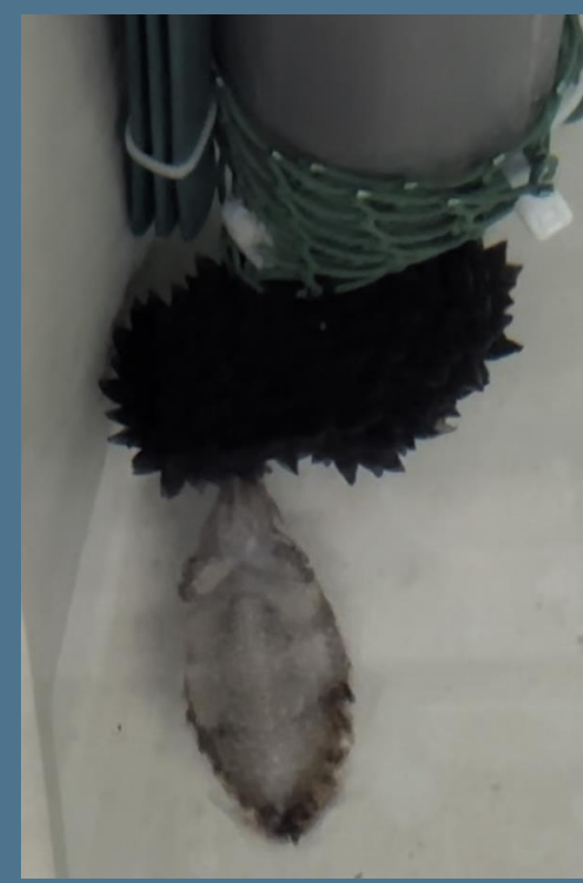
Fig. 3 – Female laying batch #2