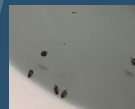
Fig. 5 – S. inermis paralarvae (5-7 days after hatching) feeding with artemia.

Table 4 – Hatching data of S. inermis viable eggs and its paralarvae. Results are shown as mean ± s.e.m.. Different superscript letters represent significant differences (p < .01, one-way ANOVA followed by the Tukey post-hoc test).