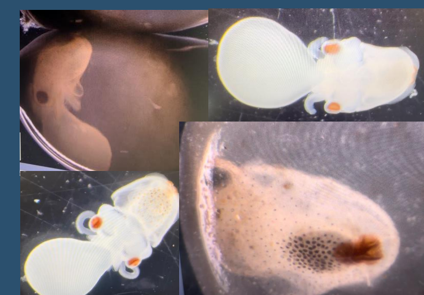
Fig. 4 – Different stages of the embryonic development in Sepiella inermis .