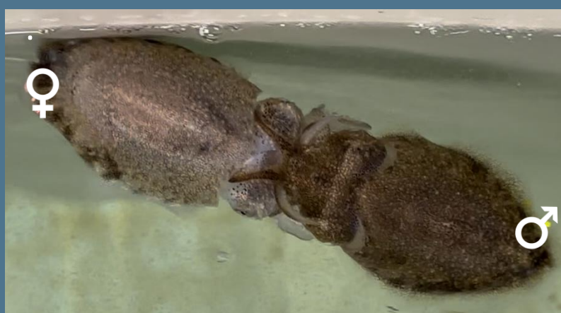
Fig. 2 – Cuttlefish mating before batch #2 was laid.