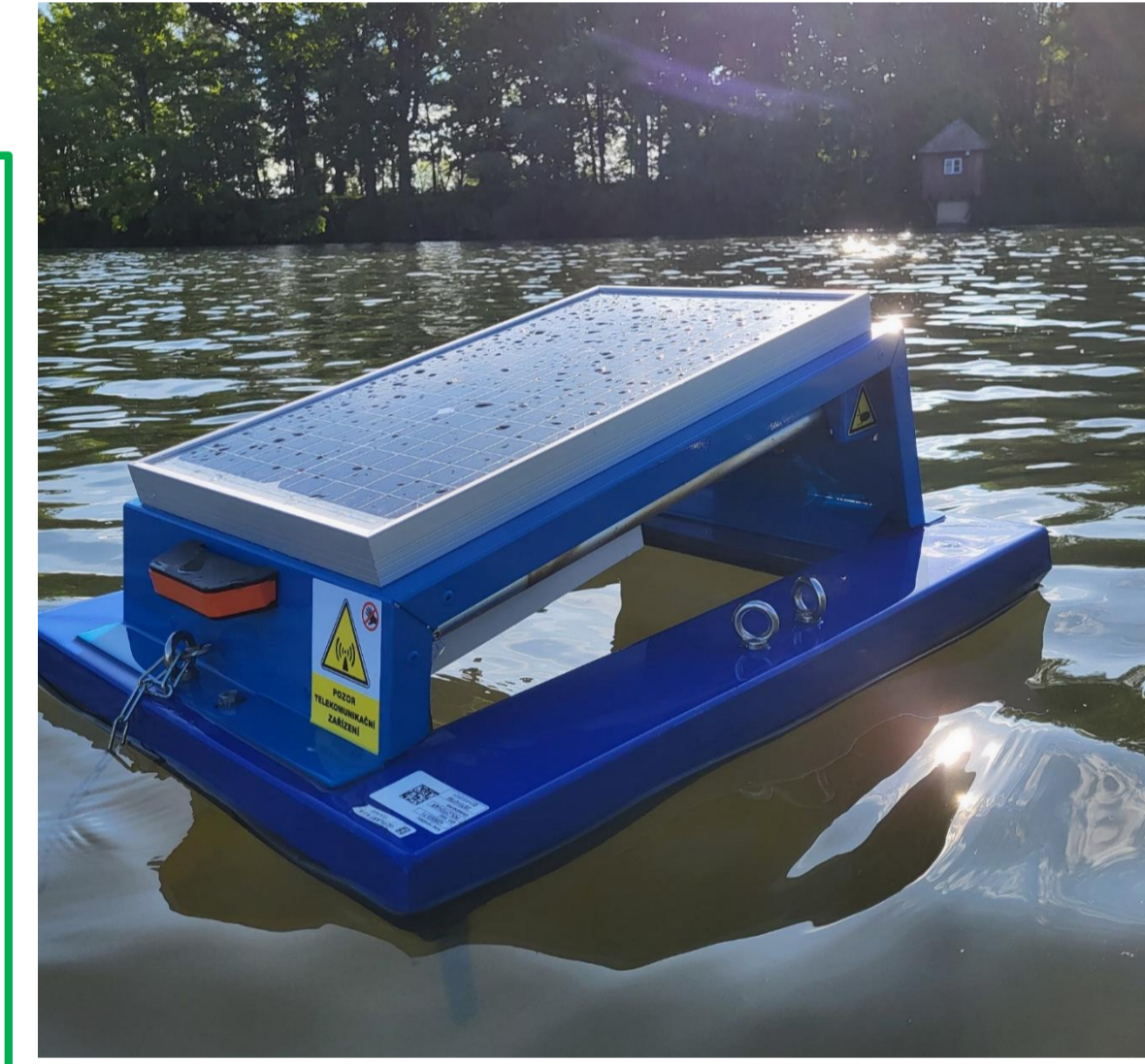
Fig. 2: Fully autonomous oximeter