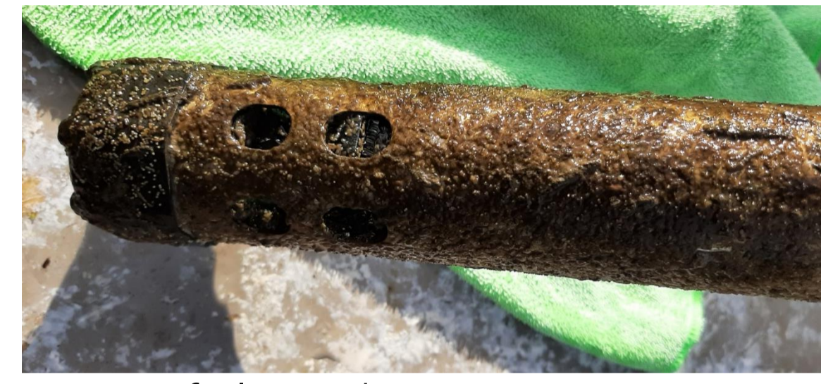
Fig. 1: Biofouling on devices in continuous use in carp ponds – despite cleaning every two weeks

The study site is located at the district Waidhofen an der Thaya in the Waldviertel Region of Lower Austria. This Region is known throughout Austria for its carp production. The high nutrient concentrations found in carp ponds result in high biological activity. A continuous measurement of DO is therefore difficult, because a biofilm forms on the measuring device in continuous use and leads to excessive maintenance work (Fig. 1). Since Mai 2024, we use a fully autonomous oximeter (SmonOX; Galvanic probe; Clark sensor, Fig. 2). This device cleans itself after each measurement and the probe is stored above the water surface, which significantly reduces biofouling. Measurements with this device are conducted 26 times per day at a depth of 0.5 m at a carp farming pond with 41 ha in size.