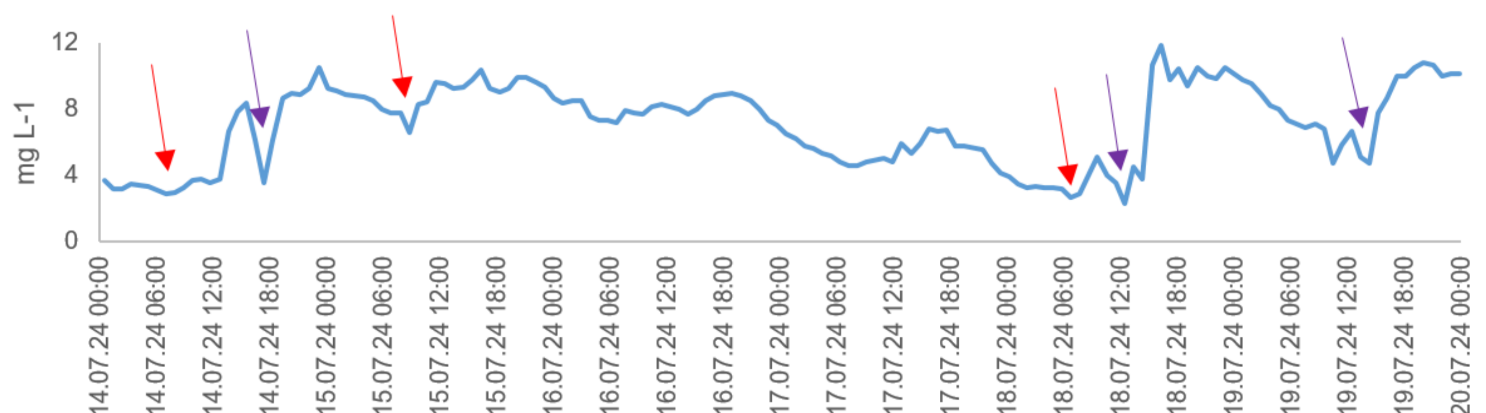
Fig. 5: Shows the DO between 14.7. – 19.7.2024. Red arrows mark the lowest concentrations in the early morning hours, which is common due to photosynthetic activity of algae and plants. Purple arrows mark the effect of the aeration (mixing the layers lowers the DO at the surface, if there is an extreme low DO content in deep layers).

On July 14 and 18, the lowest DO concentrations occurred during the morning hours, which is usual. On July 15, we carried out an additional measurement at the bottom of the pond (depth of approx. 2 m) and found a DO of 0.2 mg L -1 . The DO at the surface was in a good range that day. Therefore, the pond was aerated to remove the stratification. On 16 th and 17 th we could not find signs of stratification. On 19 th July we measured DO under 0.2 mg L -1 at the bottom. The data of our continuous measuring device indicates that, aeration of the pond successfully removes stratification, but lowers the DO of the surface. Consequently, due to aeration, DO levels at the surface can also drop around lunchtime or in the afternoon (Fig.5). When aerating a carp pond, it is important to keep this in mind and aerate at times when high surface DO levels can compensate low or even oxygen-free zones.