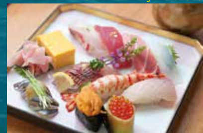
Various sushi assortments