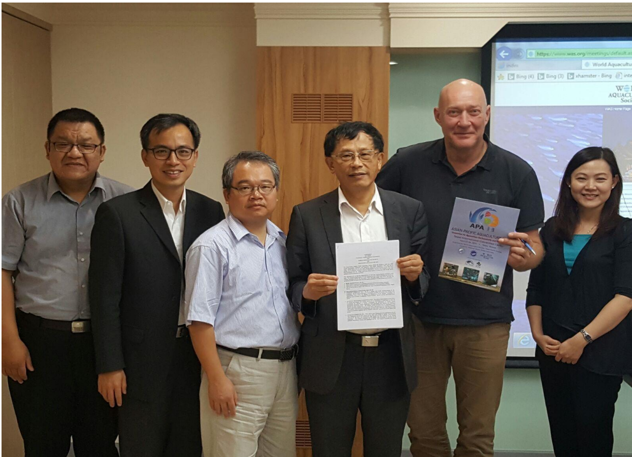
Signing agreement between WAS and NTOU.