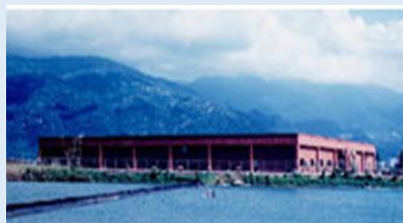
King Car – Shrimp farm