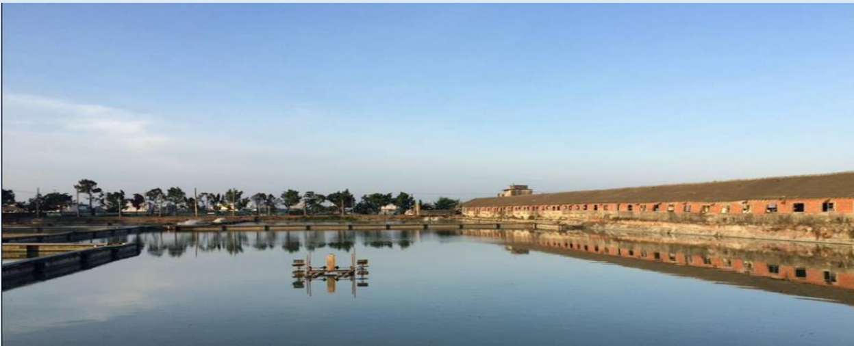
Sing Chang Koi Farm